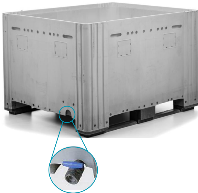
TAP PLACEMENT SYSTEM